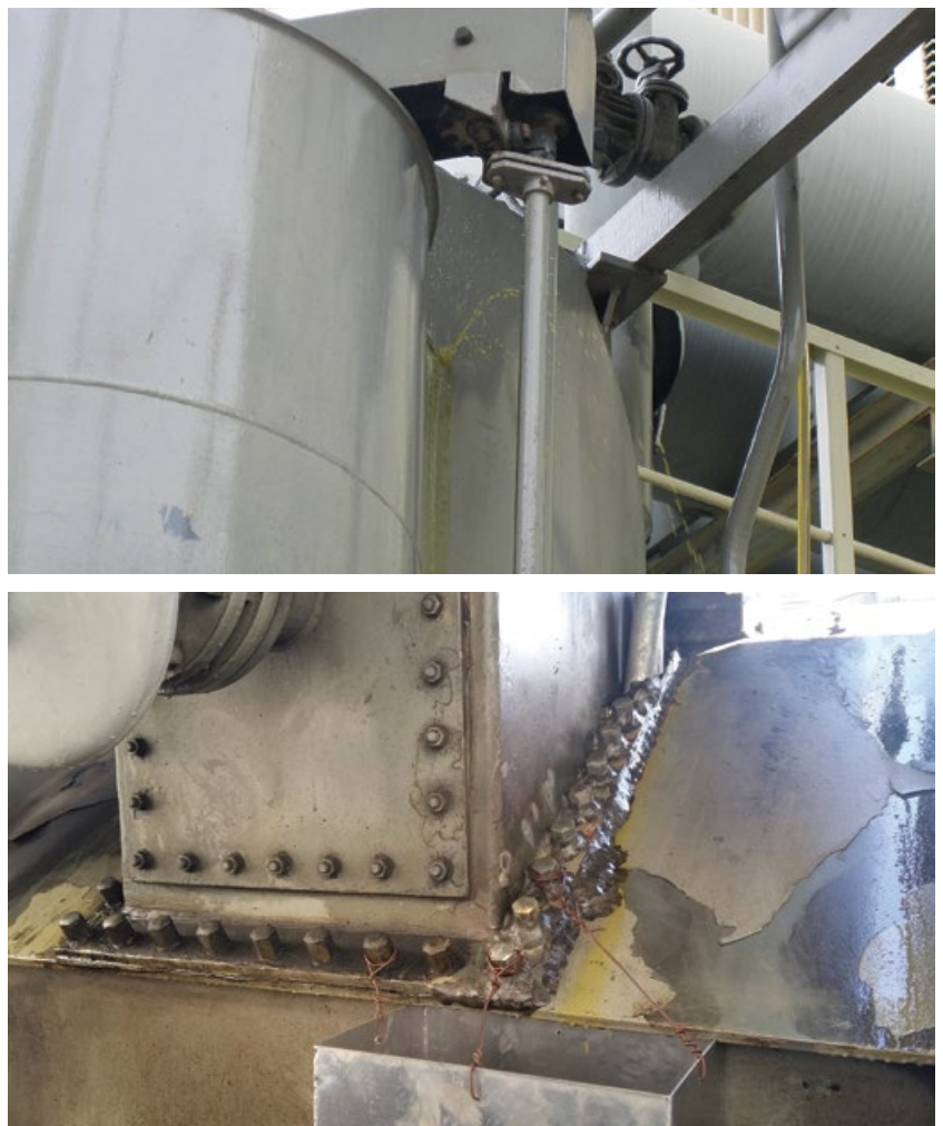
Figure 4. Leaking transformers need to be sealed

[4] Banović, Mladen, Trends in Transformers Technology , Transformers Magazine, 2018