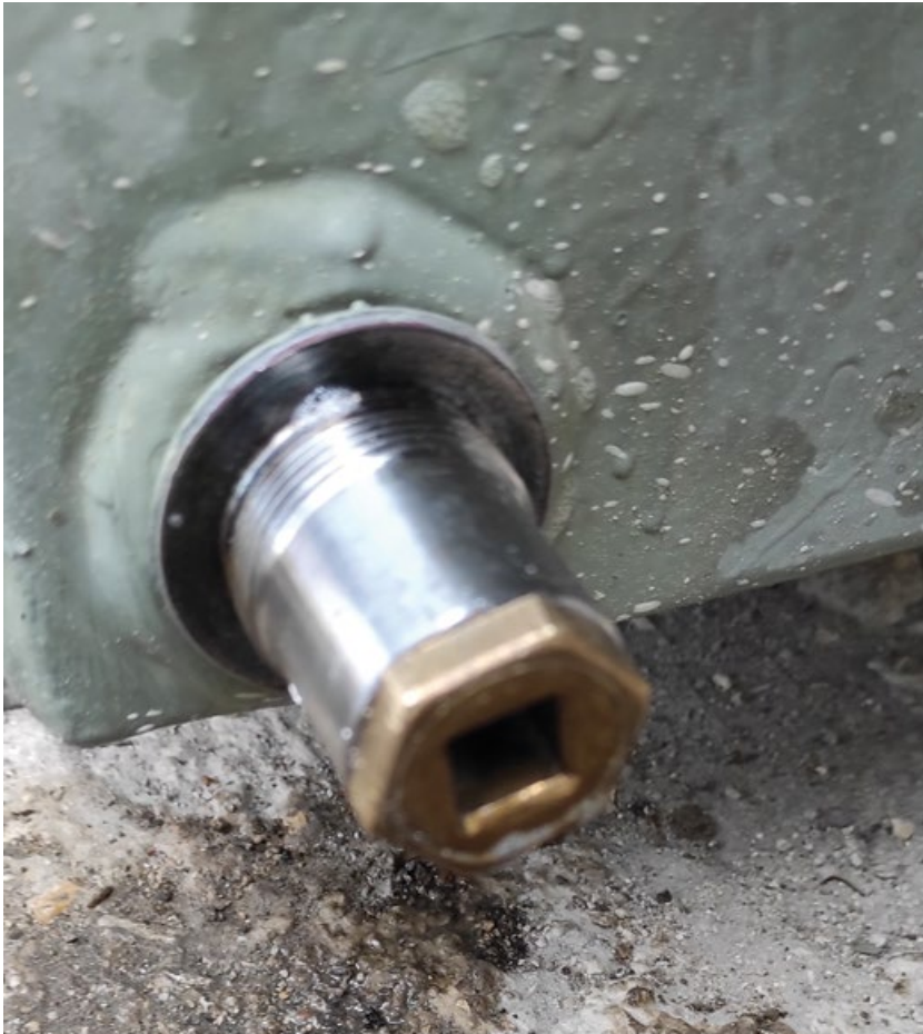
Figure 3. The recommendation is to only apply long intervals when testing the transformers equipped with this type of valve

Sampling oil from power transformers should be carried out judiciously. Sampling should be carried out using a proper volume and a proper vessel and be synchronized with the measuring procedure, and the transport of the sample to the testing lab should be